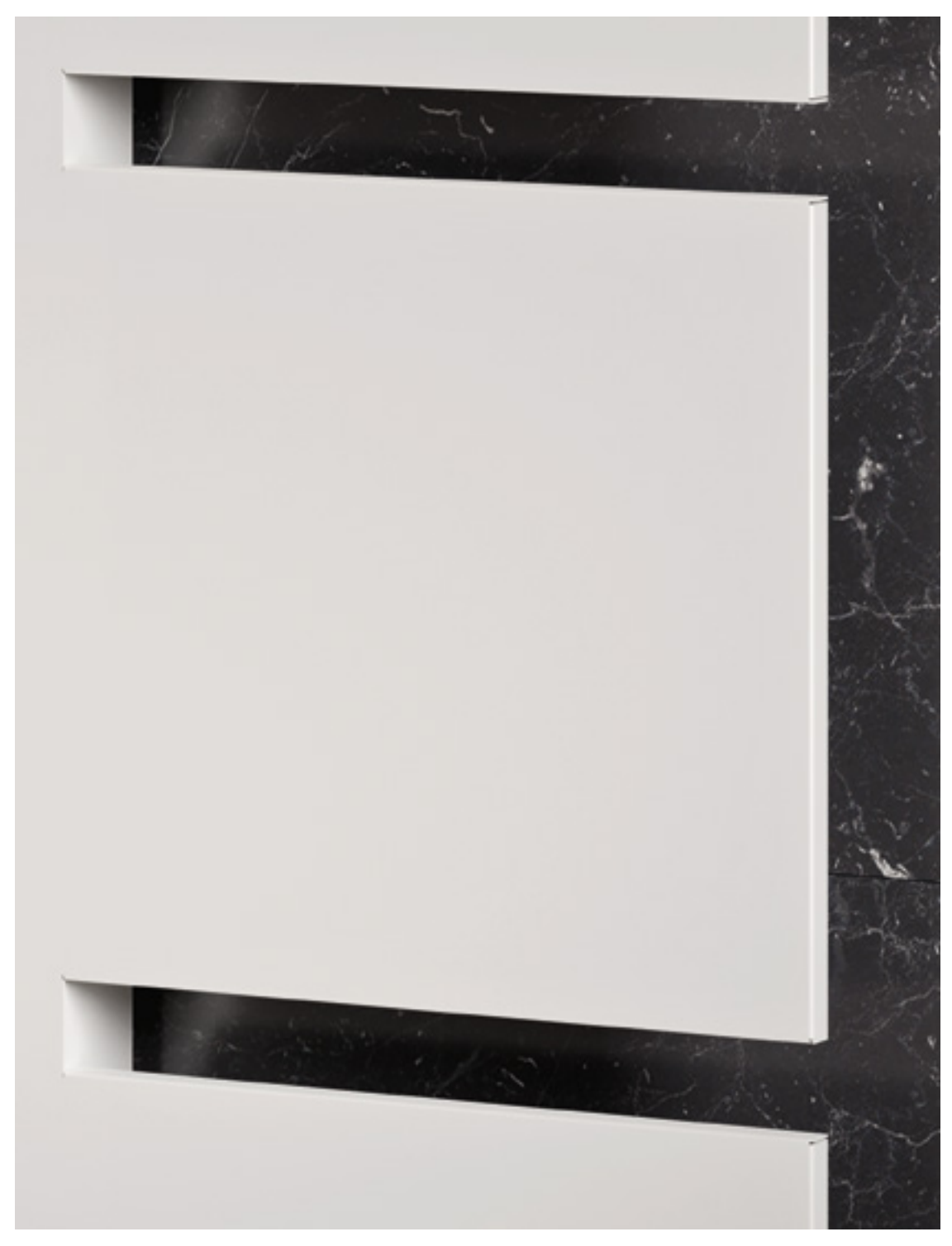
SEQUENZE ELECTRIC height 1735 mm, lenght 500 mm. Matt White finish (cod. J8). Designed by Angeletti & Ruzza